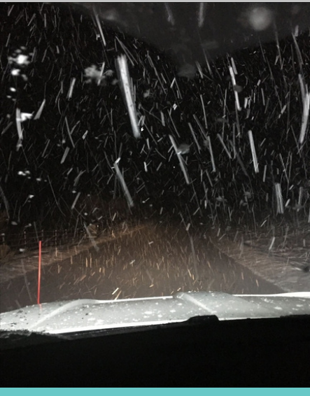
Snow plow view after lights