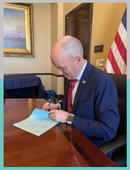
Governor Spencer Cox signing HB 292-Snowplow Ammendments