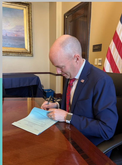
Governor Spencer Cox signing HB 292- Snowplow Ammendments