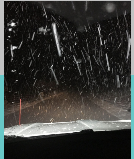
Snow plow view after lights