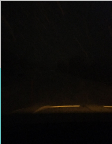
Snow plow view before lights

https://le.utah.gov/~2024/bills/static/HB0292.html